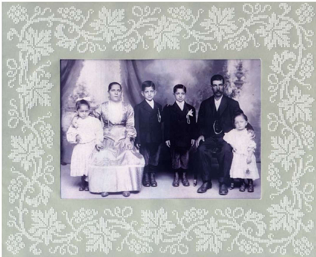
My grandmother's family in a grand frame. She is the cutie-pie on the far right.

For your convenience you can place an order on the website after Feb. 29. However, the order will not ship until June, after we return.